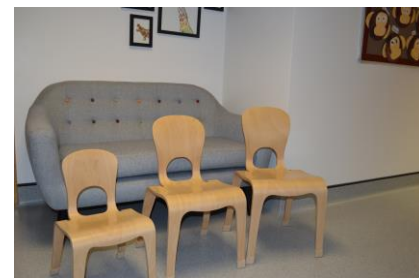
Our new, solid wood, ergonomic chairs