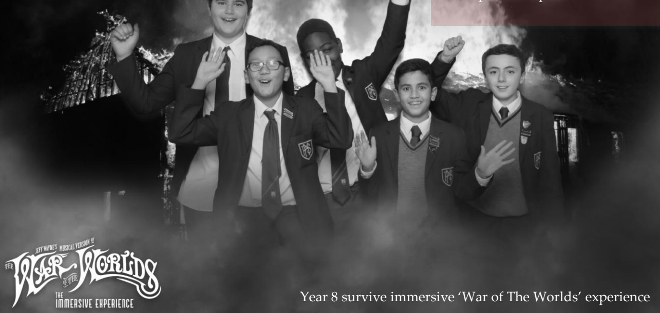
Year 8 survive immersive 'War of The Worlds' experience