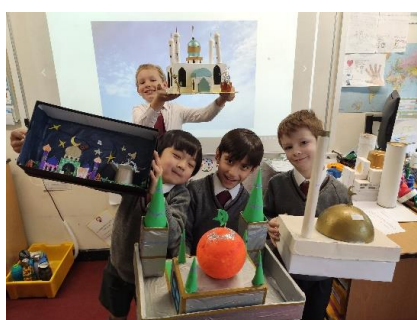
Mosque projects proudly displayed