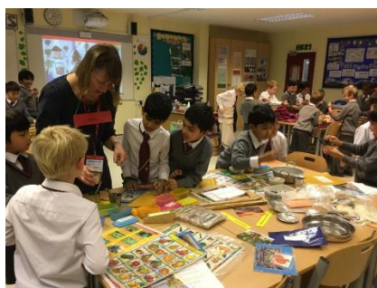
Chembakolli workshop in action