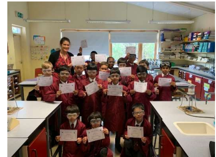
Year 4 Bunsen burner licences

It has been the week Year 4 have been looking forward to with great anticipation as they have had their first go at using the Bunsen burners! They were delighted to receive their Bunsen Burner licences so are now fully qualified to set up, light and use the Bunsens for heating in the lab.