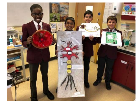
Year 7 specialised cell models

Year 7 have just finished their topic on cells and were very proud of the fantastic, specialised cell models that they created. Well done to all the boys for a really super first half term of science learning in the labs!