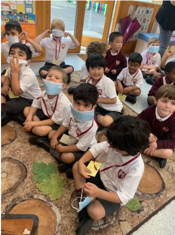
Future medical students in Reception