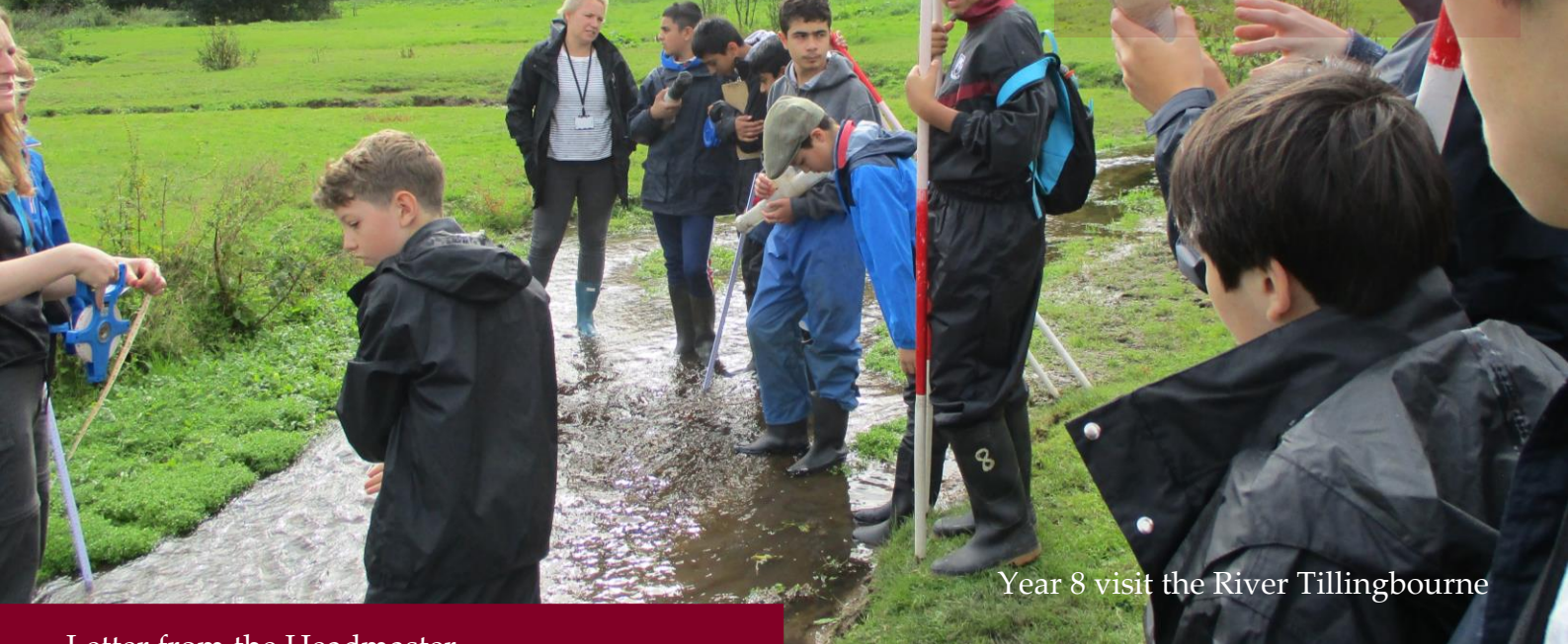
Year 8 visit the River Tillingbourne