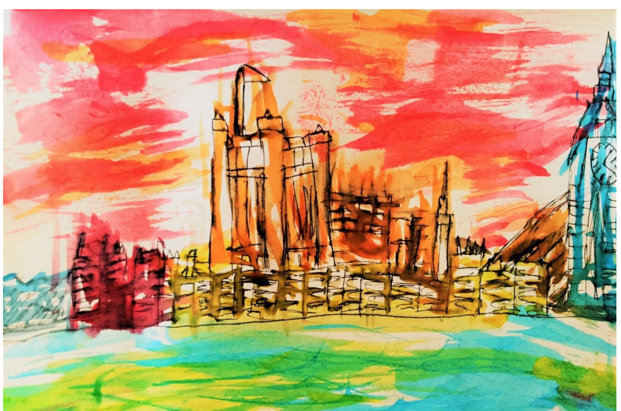
The Colour of Busy London - Arjen 8S