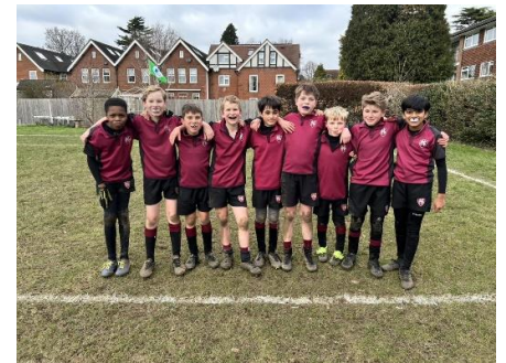
A valiant (and very muddy) U11 Team