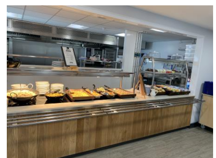
Fine dining in our new kitchen awaits the boys!