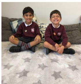
Pre-Prep Students of the Week

As the weeks go by we will be doing lots of exciting things and filling our classrooms with the boys' work as well as getting stuck in to learning, which the boys are looking forward to. Lastly, please could we remind parents to provide us with a photo for your son's coat peg as it makes it a lot easier for the boys to find their belongings.