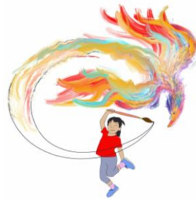
The Magic Paintbrush

In Year 1, we have continued with our focus text 'The Magic Paintbrush' retold by Julia Donaldson. We developed our depth of character knowledge through 'hot seating'. In this activity we asked and answered questions as the characters from the story.