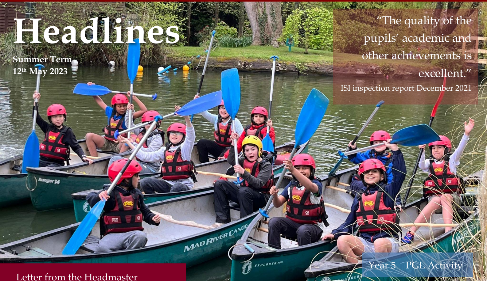
Year 5 – PGL Activity