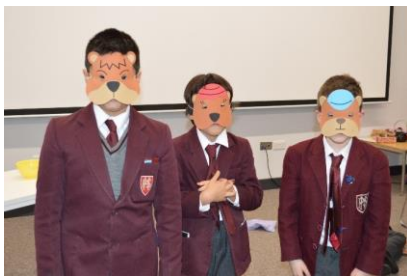
Our bear trio!