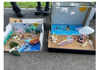
Year 2 seaside boxes