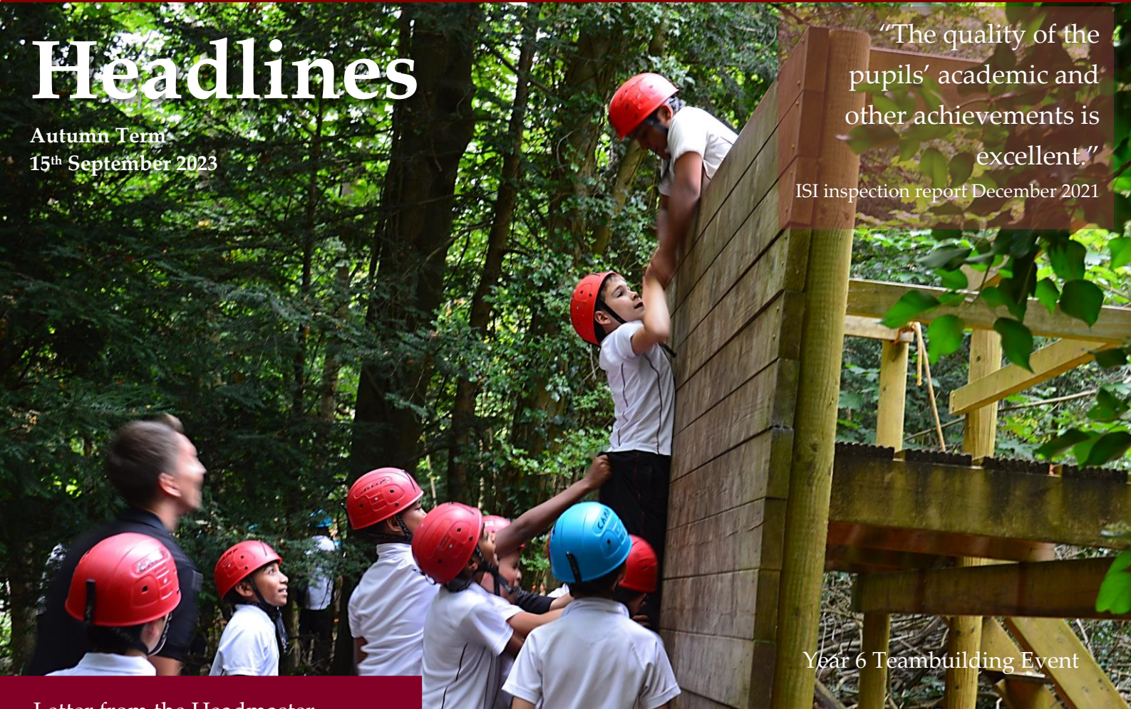
Year 6 Teambuilding Event