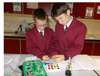
Year 6 Acids and Alkalis