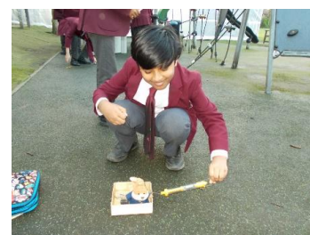
Year 5 Friction Experiment