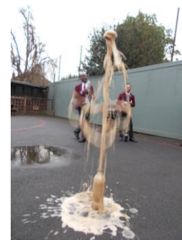
8S pressure experiment

Year 5 took advantage of a brief spell of dry weather to go and investigate friction outside. They placed masses, and 'bunnies', into boxes and used Newton meters to drag the boxes over different surfaces in order to determine which surface creates the most friction. The boys concluded that carpet created the most friction, and this must be why we get carpet burns... ouch!