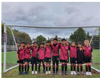
U13 'A' team