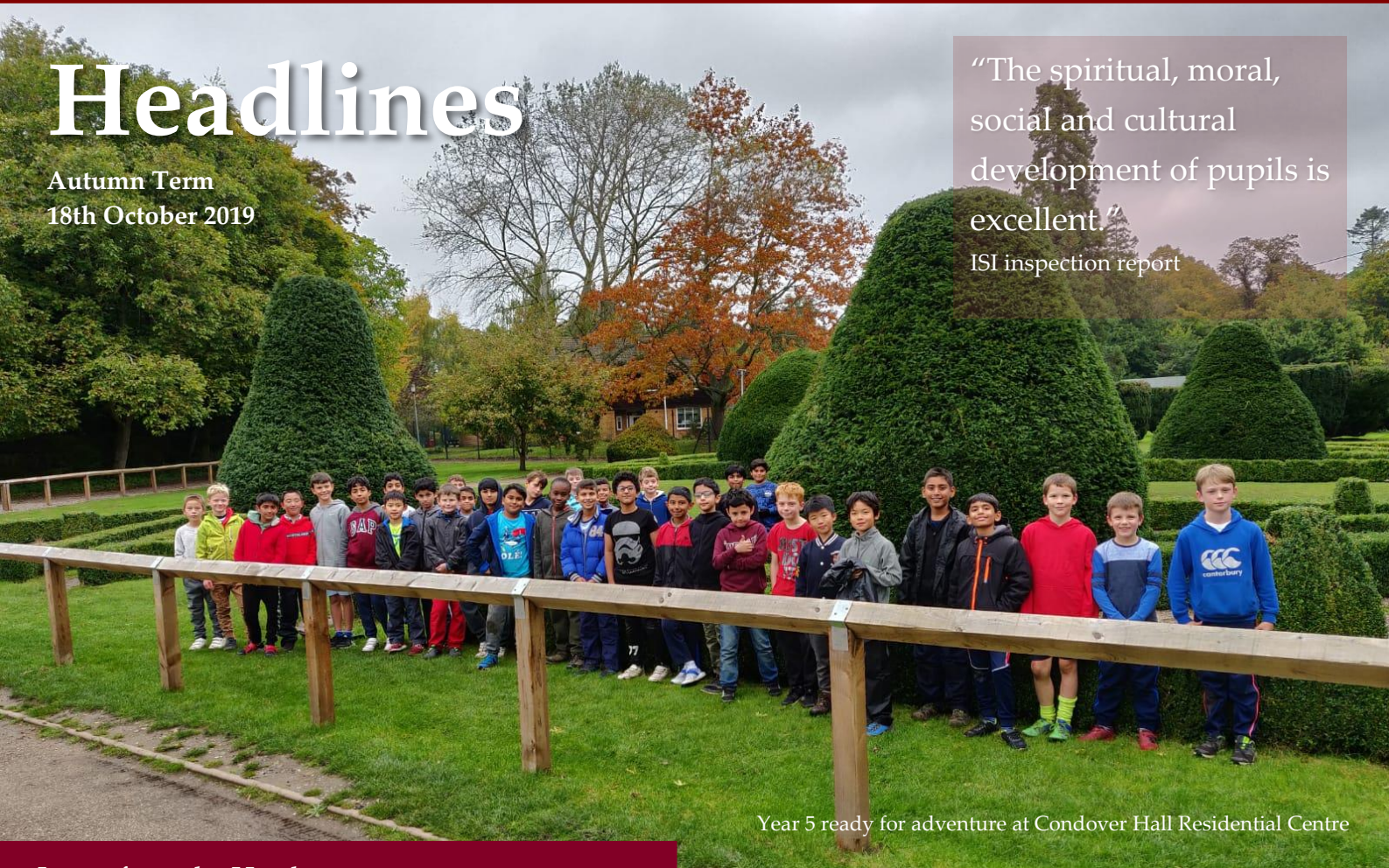
Year 5 ready for adventure at Condover Hall Residential Centre