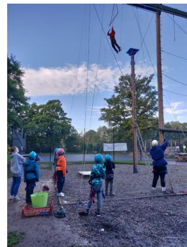
Condover Hall exploits