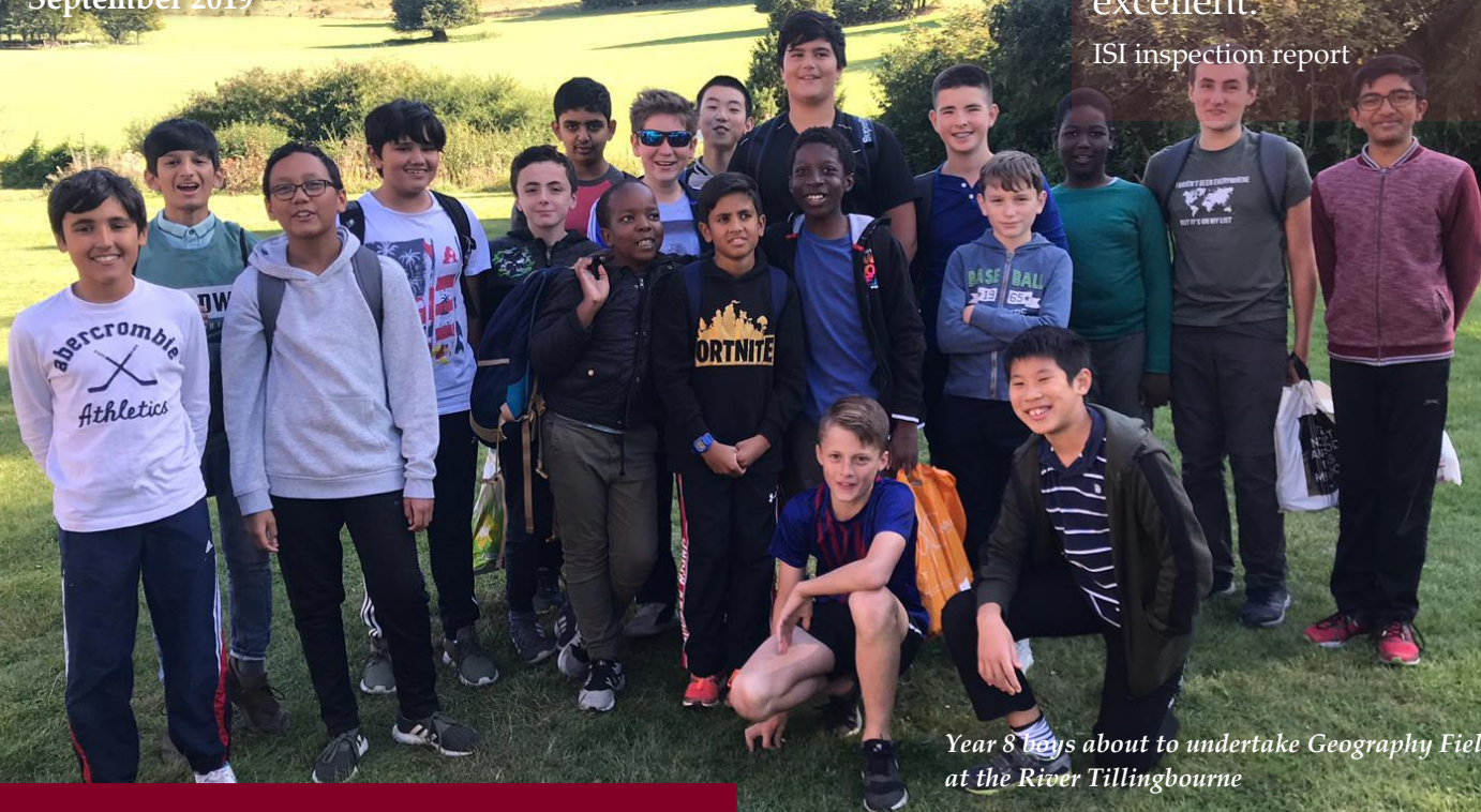
Year 8 boys about to undertake Geography Fieldwork at the River Tillingbourne