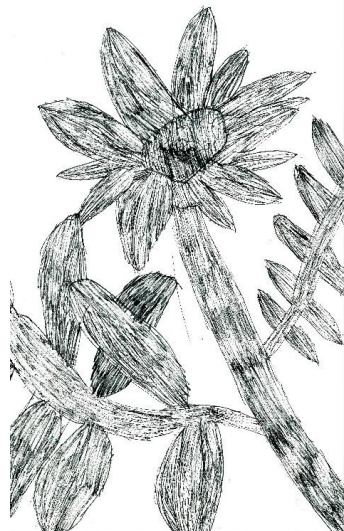
Ethan C, Year 4 Monochrome Flower