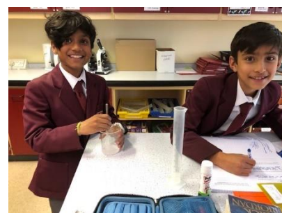
Year 6 solutions