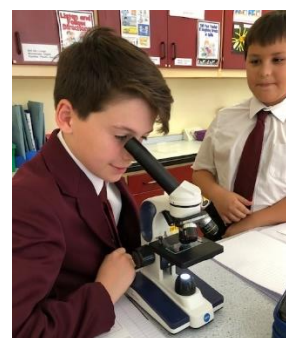
Year 7 microscopic evaluation