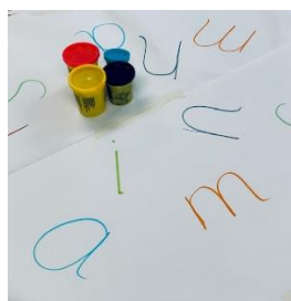
Art meets Literacy...