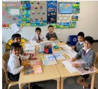
Year 1 Passion for Reading

Year 1 continue to impress us with their hardworking attitude, approach to learning and their commitment to reading daily. As a result, we have expressive, fluent readers with a passion for literature!