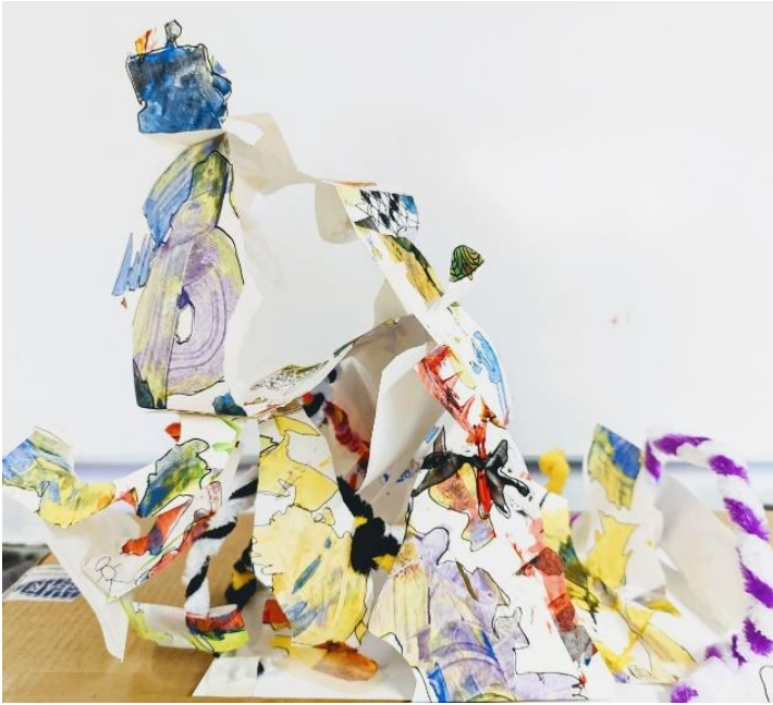
Austin, Year 3 – ‘Smoke of Colours’ Sculpture