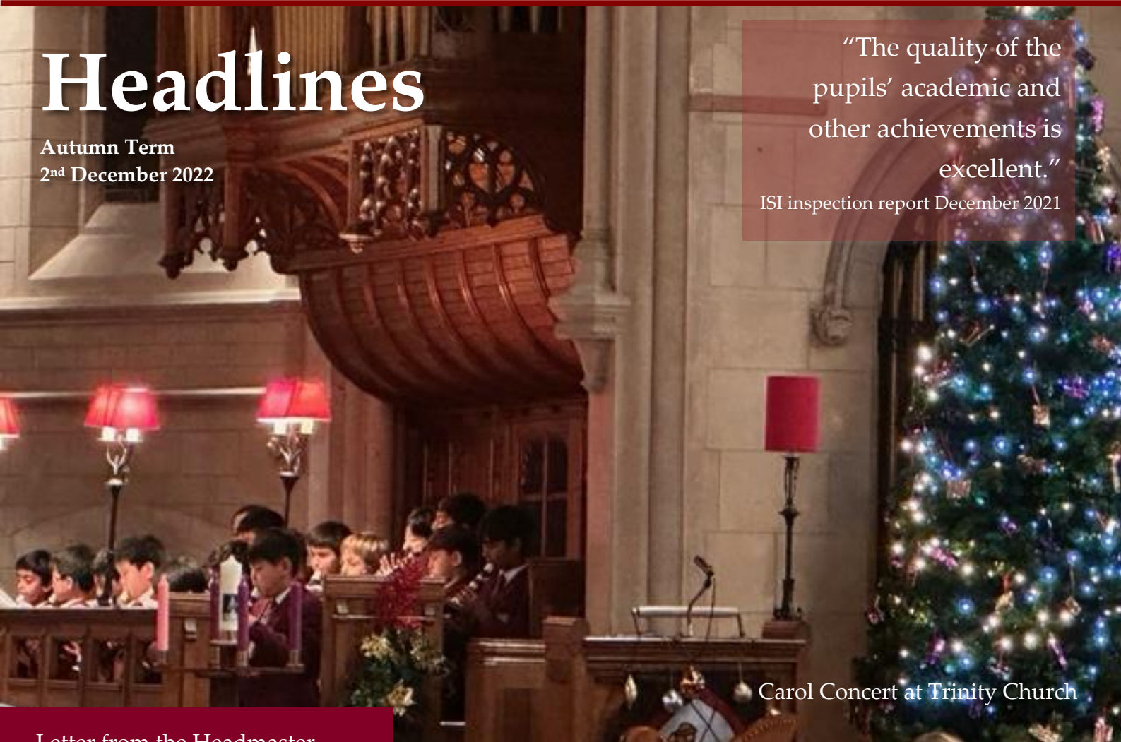
Carol Concert at Trinity Church