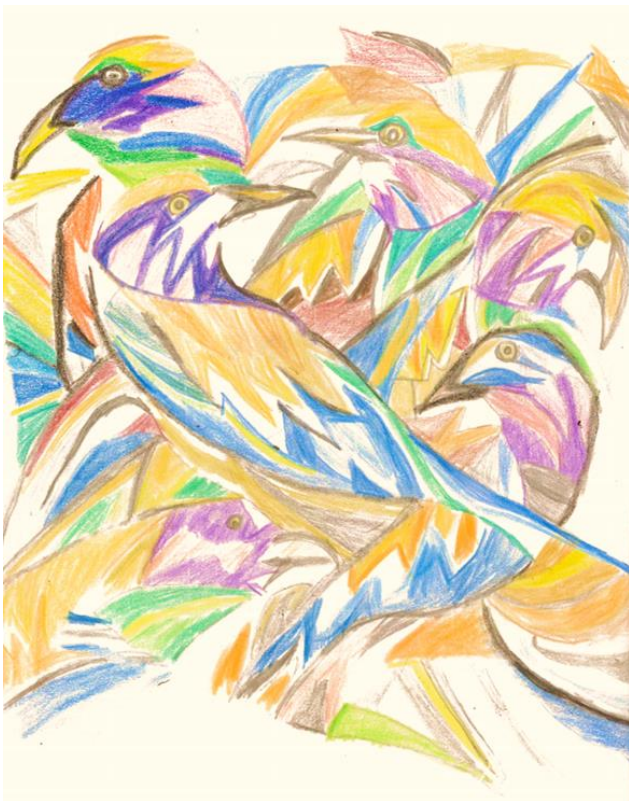
Ohki M, Year 6 - African bird work