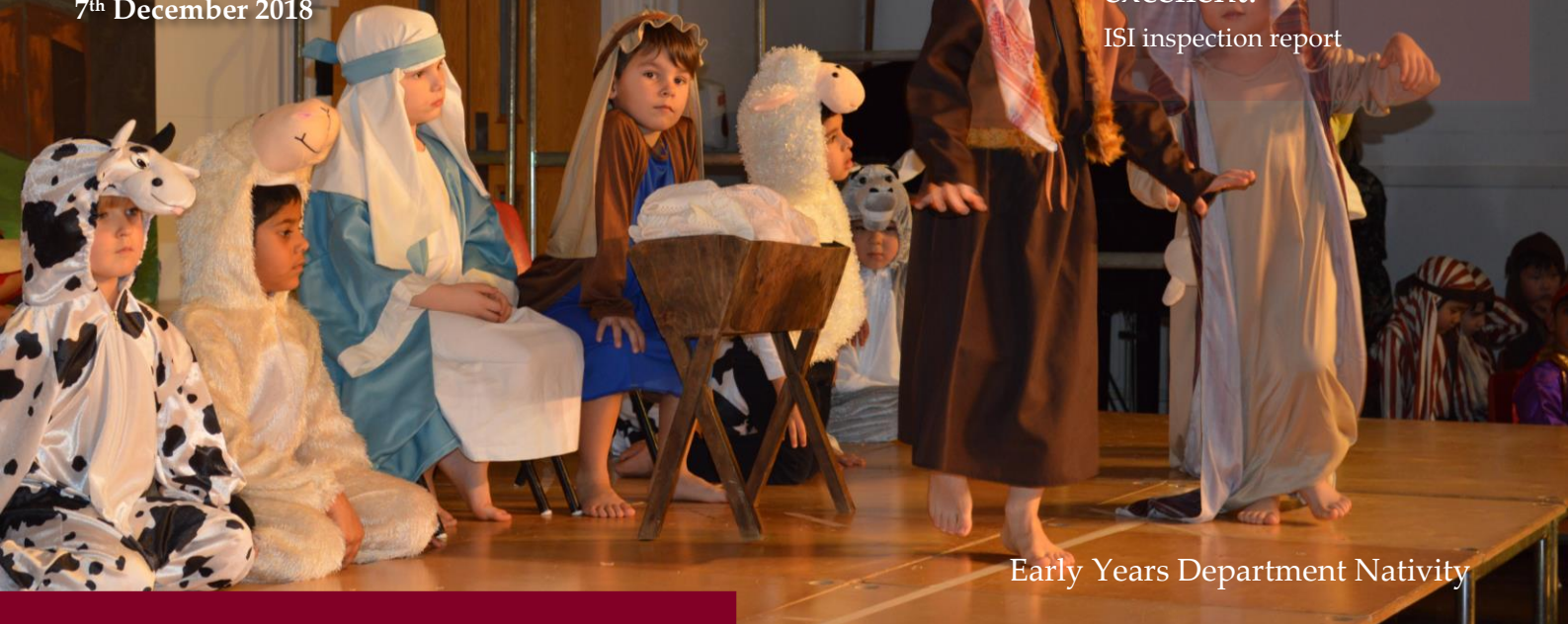
Early Years Department Nativity