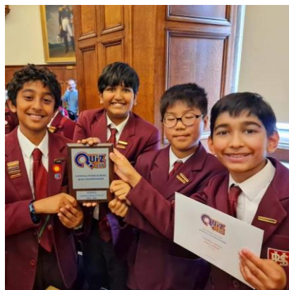
Science Quiz Team