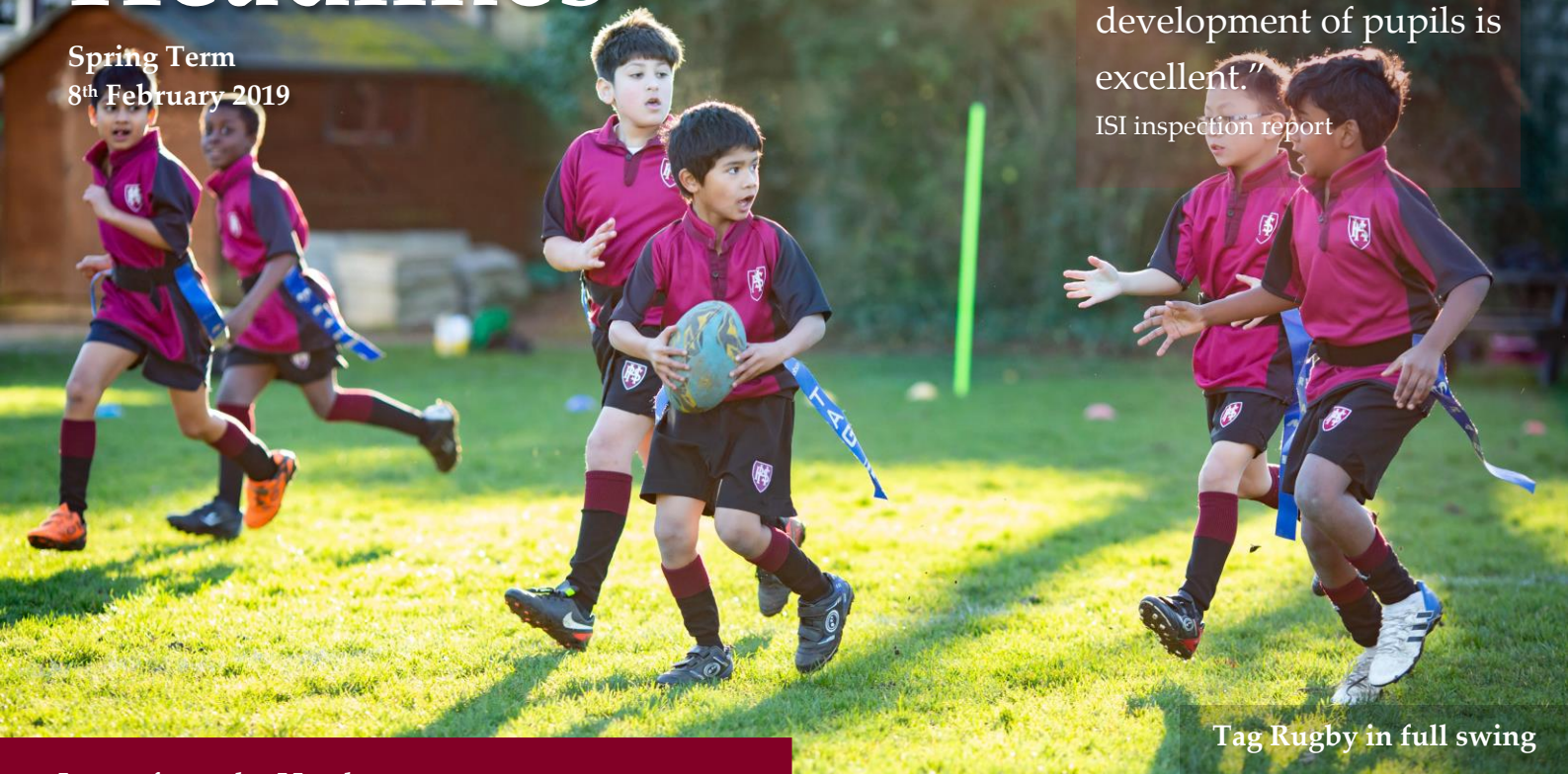
Tag Rugby in full swing