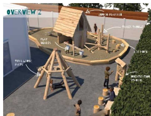
Proposed Early Years’ playground

The last job on my bucket list as Head here. I will be keeping an eye on all of this during the holidays, so that the boys have something wonderful to come back to.