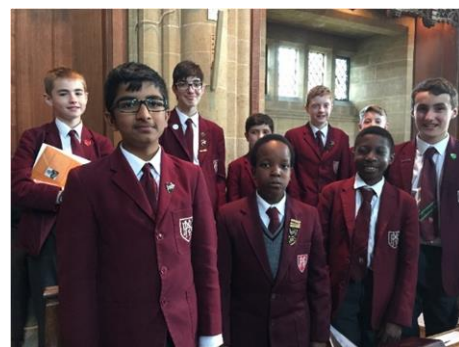
The Chamber Choir Alto section