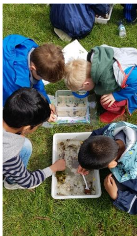
Year 2 at Sutton Ecology Centre