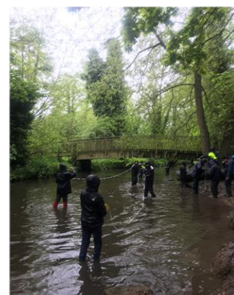
Outdoor Learning: Homefield 'Adventurers' at Hindleap Warren and Lullingstone