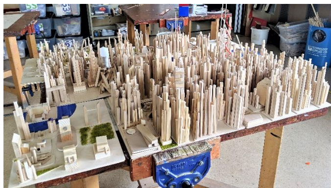
Year 8H, The 'Megacity' Under Construction